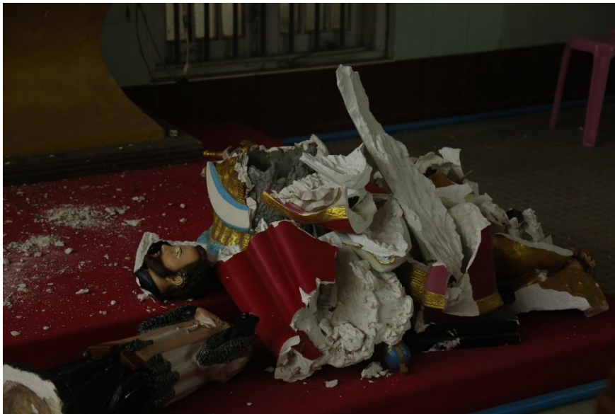
St. John Church