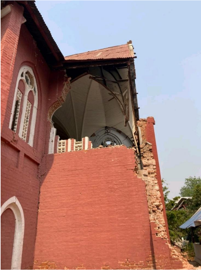
St. Vincent de Paul's church (Zawgyi)