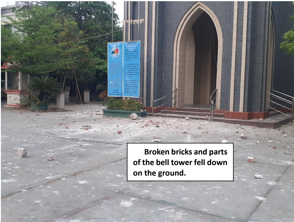
Broken bricks and parts of the bell tower fell down on the ground.